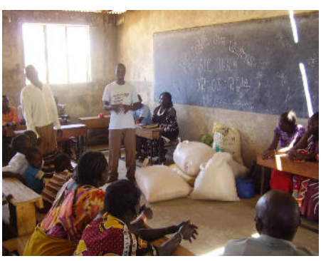
AIC Makutano donating food to the school (Moi Masol Academy)