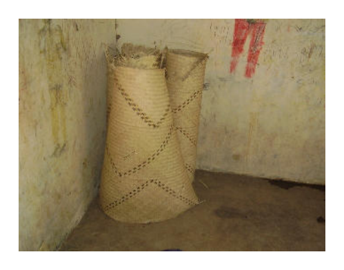
Folded Mats (Mkeka), is a sign absenteeism (children sent home during the drought)

Thanks to WM USA, we were able to support the children at Moi masol Academy and Nyangaita. Our Sunday porridge programme also help feed at least 120 children. WMK also sent bags of maize to the people of Kakleshon and Nyangaita. Currently, affected areas include Takaywa, Nauyapong, Alale, Nyangaita, Ombolion, Kodich and Kamanau. To contain the crisis in our area of operation in future, more support will be needed to support many families. WMK will continue to work with it's partners and other stakeholders to help feed over 2000 children in schools in different regions of Pokot. We also thank AIC Makutano, kapenguria who last month donated food: two bags of Maize, one bag of beans, one bag of porridge flour, cooking oil, sugar and vegetables. Moi Masol academy received the food on behalf of the children. We thank God for everything. Thank you AIC Makutano for your kind donation.