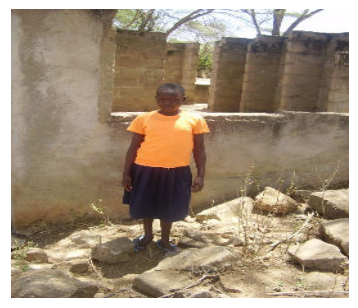
Maureen Chebet (Single Orphan) - Class 7