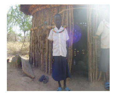
Stella Kasemcho (Single Orphan)- Class 2