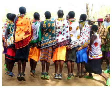
Pokot Women Dancing and young girls

To motivate, inspire them to be active citizens of and in their