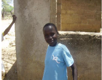
No Name (Not confirmed)