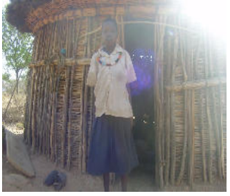
Maureen Cheyech (Single Orphan ) -Class 2.