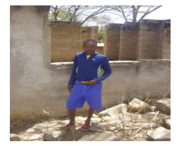
Ishmael Longrokwang (Total Orphan) - Class 7