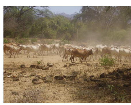
Animals grazing and searching for water (some walk up to 50 km)