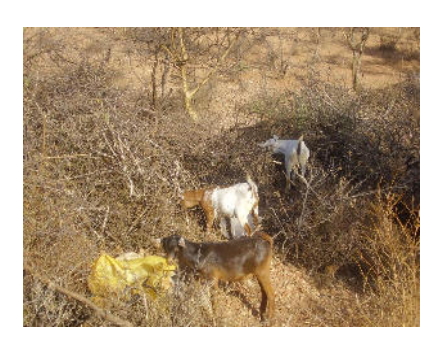
The Extent of Drought in Kakleshon (Wei Wei)

No region in Kenya faces the devastation of drought as Turkana and Pokot. Averagely, during the dry seasons, temperatures in Pokot and subsequent areas have risen to a high of 40 degrees Celsius. During such times, the people and animals suffer a lot. As a result, the Pokots who live in the affected areas are forced to move to other regions forcing children to drop out of school. Many children and animals die as a result of food shortages. This year, drought and famine has already claimed the lives of many according to the Nation newspaper of 03/02/20014. During such periods, the government is often forced to postpone the opening of schools in Pokot to attend to the crisis. Currently, over 200,000 Pokots are facing starvation and hunger. Some Pastoral communities in Pokot have reportedly migrated to the neighboring Uganda. As a result many schools sent their children home in the months of January and February. In certain areas people were forced to eat toxic wild fruits which have to be boiled for hours to make them safely edible.